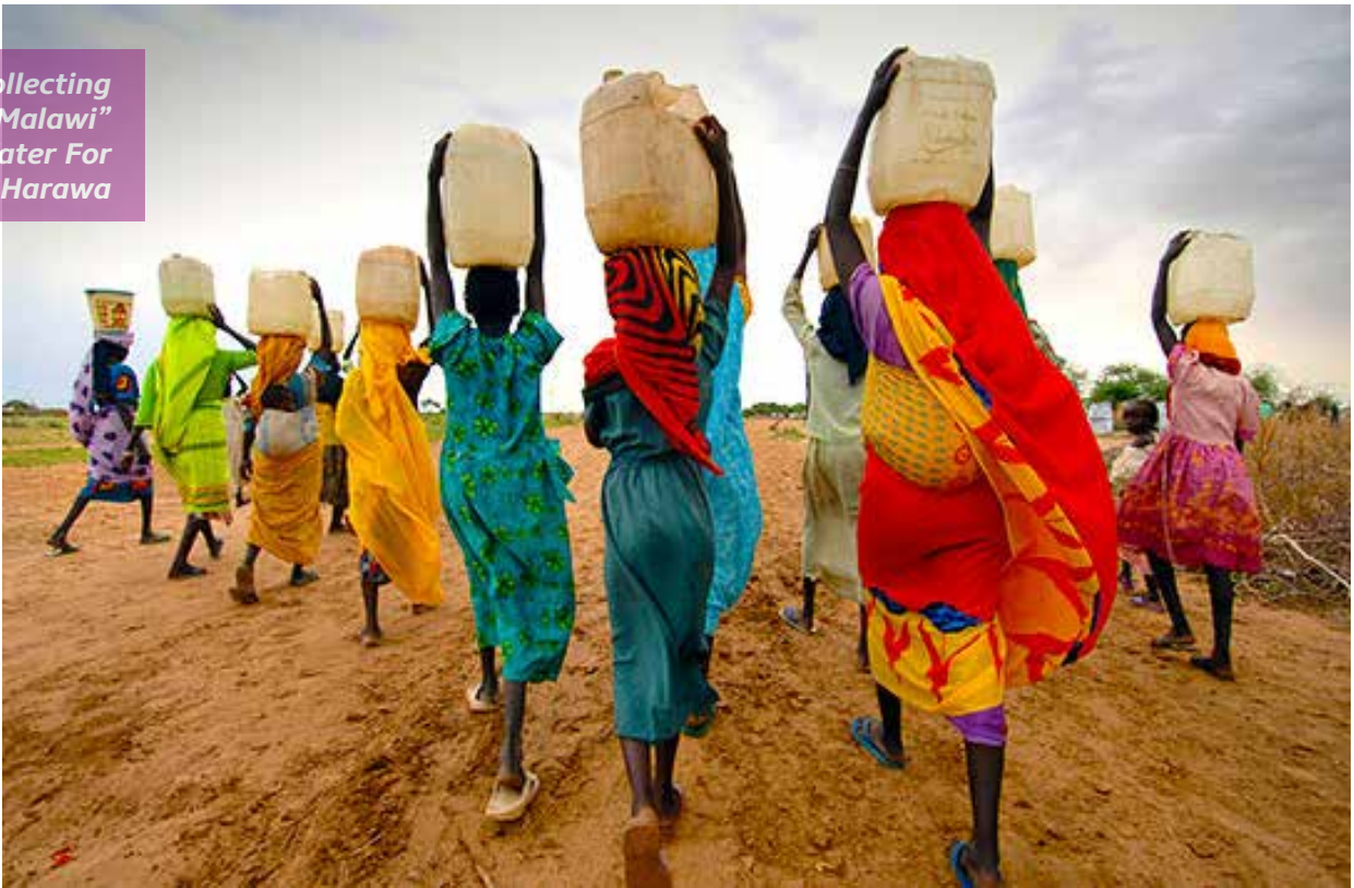
“Women Collecting Water in Malawi”

significantly to the burden of unpaid work. Water and sanitation as public goods are also essential in managing irrigation, climate disasters and sustainable livelihoods and, as discussed above, privatisation of water delivers a discriminatory burden to economically poorer households.