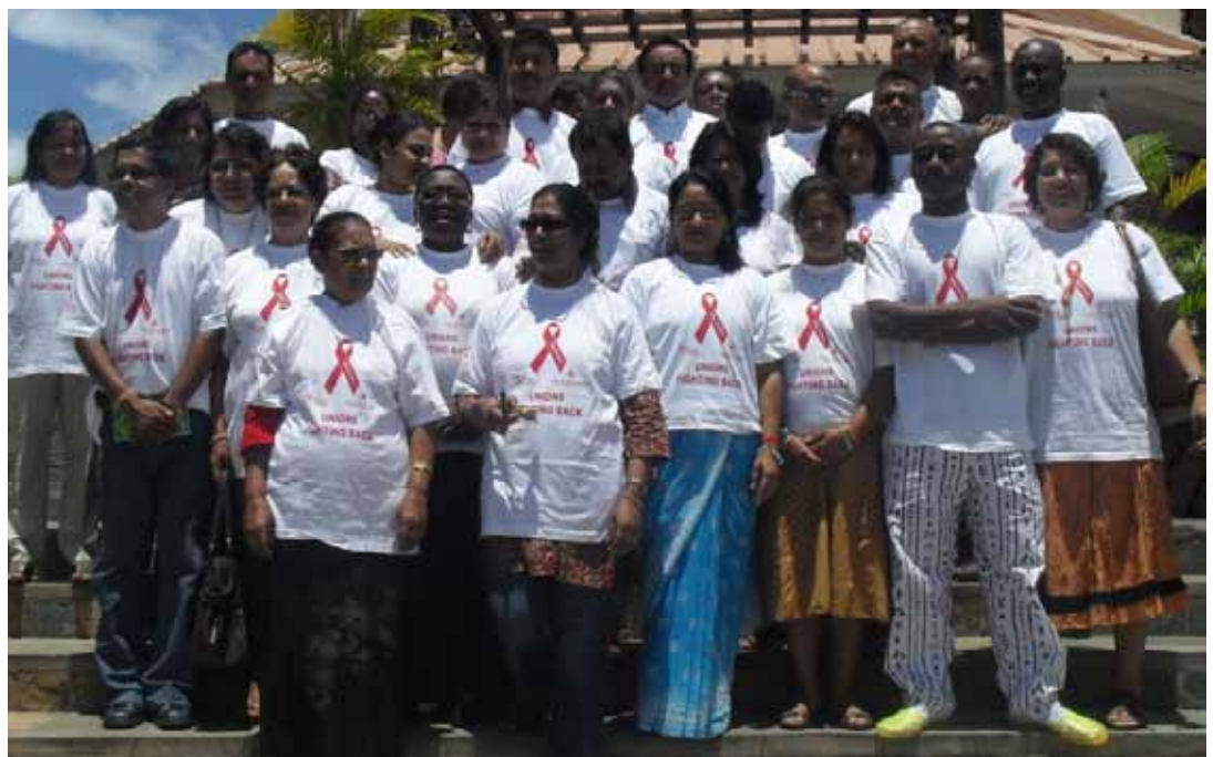
National seminar on HIV/AIDS in Mauritius, February 2010.

Partner unions gave high priority to defending the rights of those directly affected by HIV, including carers as well as workers living with HIV, whether openly or not – in particular the rights to continued employment, to non-