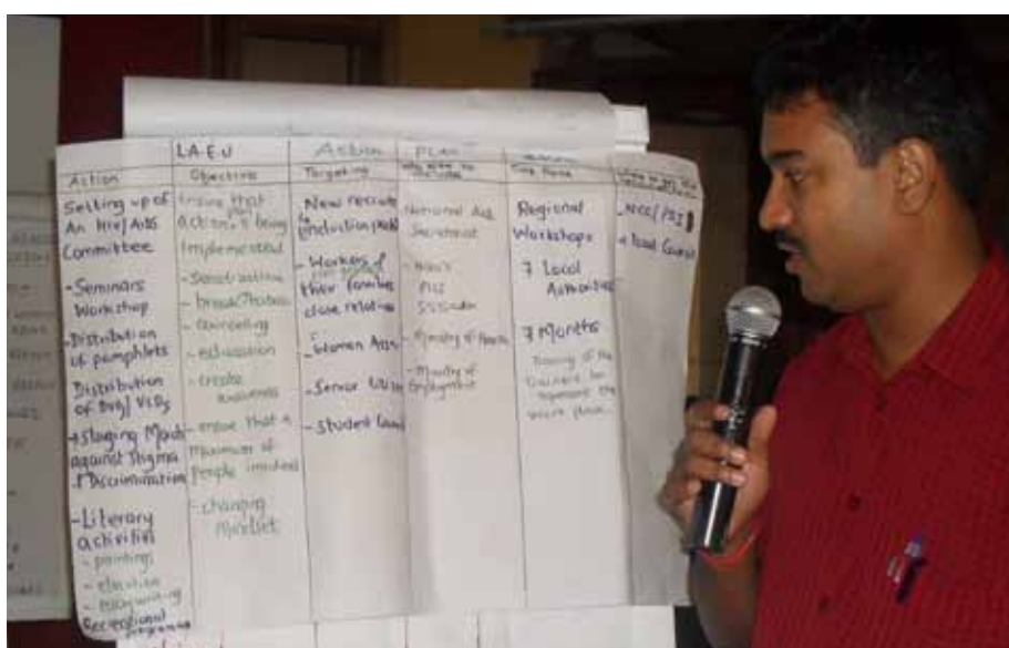
Union activist presenting union plan during national seminar on HIV/AIDS in Mauritius, February 2010.

All the unions were committed to the introduction of workplace policies and programmes 2 on HIV, but understood the benefits of linking the issue to other