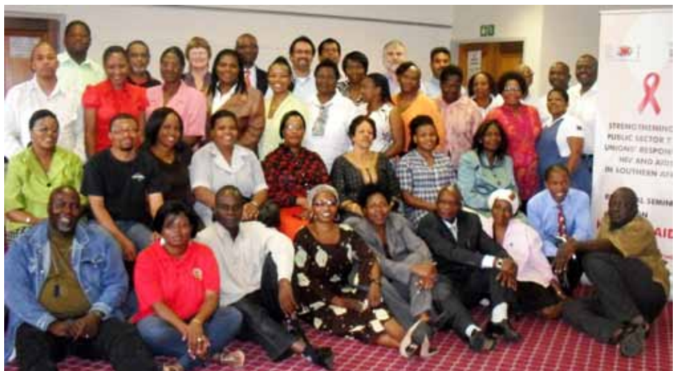
Regional seminar in Johannesburg, February 2011.

The report also emphasises the broader development context of the project and urges development planners and decision-makers to learn from it the many ways trade unions can contribute to policy formulation, planning and implementation: