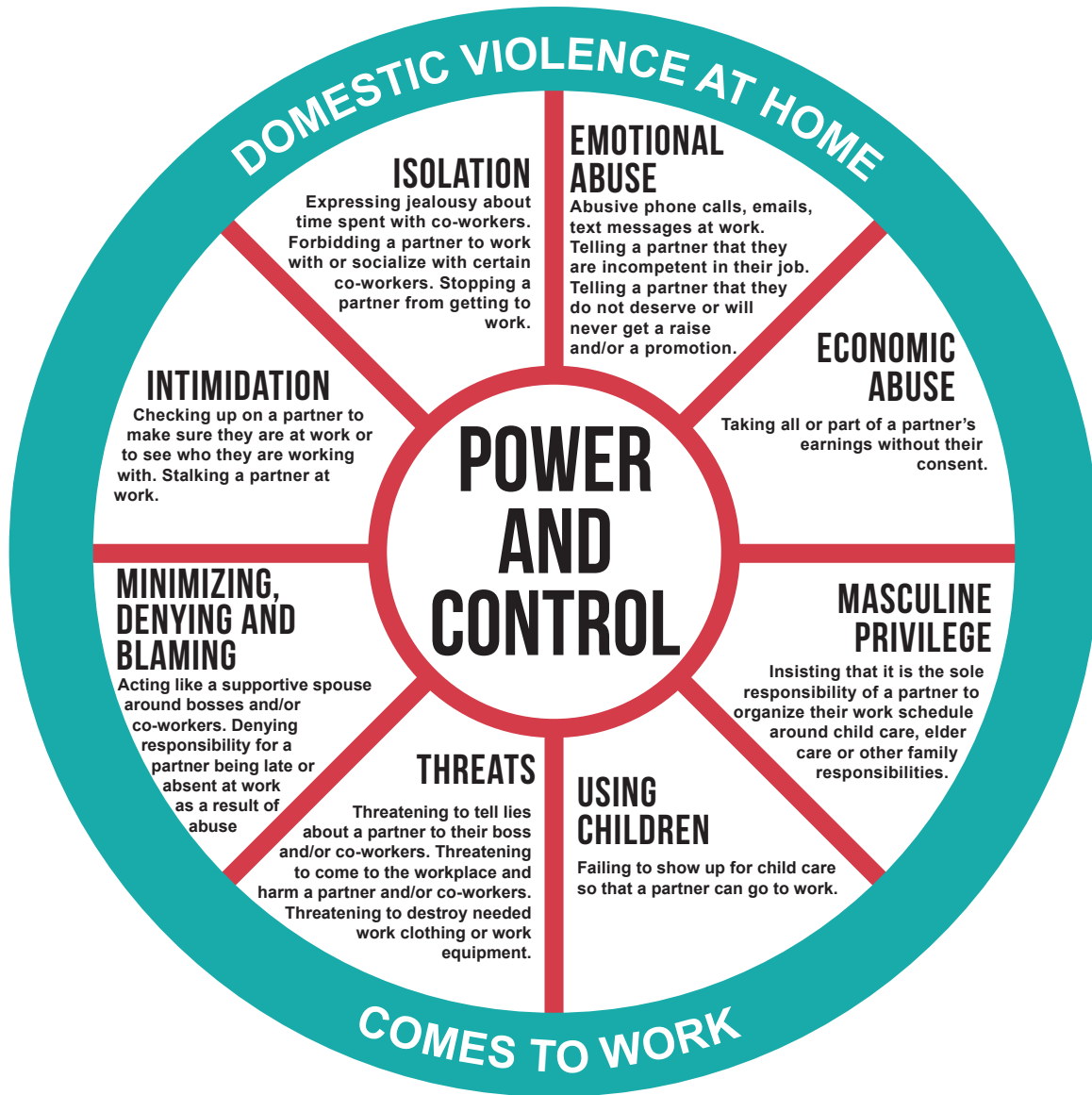
CHART 1: IMPACT OF DOMESTIC VIOLENCE AT WORK

This version of the Power and Control wheel, is adapted with permission from the Domestic Abuse Intervention Project in Duluth, Minnesota, and Futures Without Violence www.futureswithoutviolence.org .